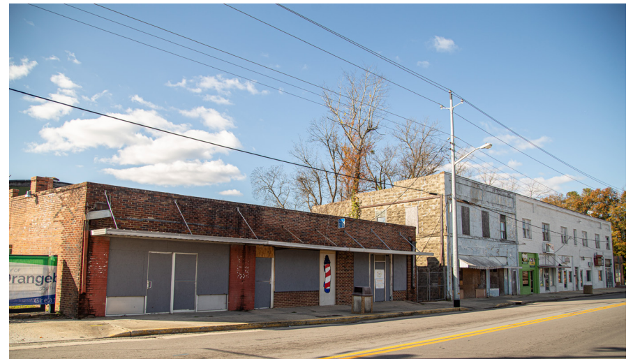
State Theater and adjacent buildings, Boulevard Street