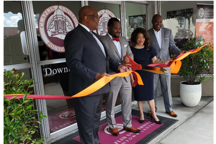
Claflin University Center for Social Justice, Summer 2021