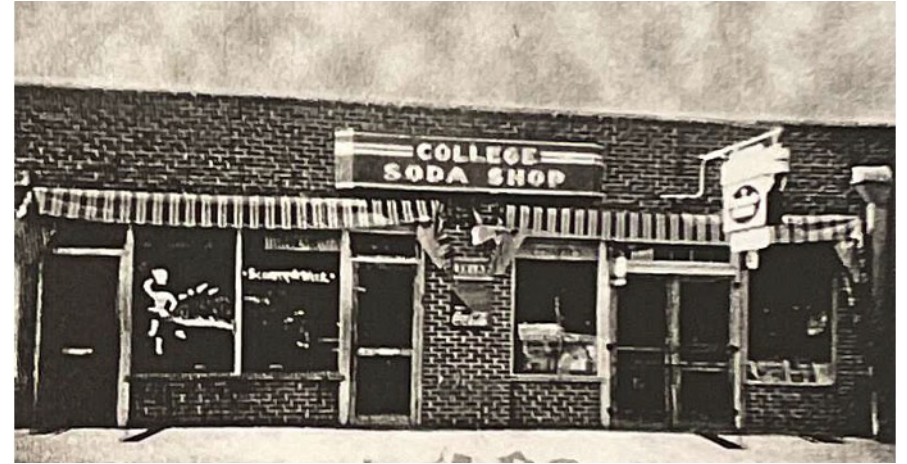
Former College Soda Shop

In the early to mid-20 th century, the Railroad Corner was a thriving hub for African American businesses. Of prominence were the State Theater and the College Soda Shop, both of which served as community anchors. In 1968, the Railroad Corner became the physical midway point between the sites tied to the Orangeburg Massacre. On Feb. 8, 1968, four years after the passage of the Civil Rights Act, about 200 Claflin and SCSU students gathered on the SCSU campus (east of the Railroad Corner) to protest racial segregation at the All-Stars Bowling Alley (west of the Railroad Corner), where several students had been denied entry three days earlier. State patrolmen opened fire on the unarmed demonstrators, killing 3 men and wounding 28 individuals. While it is one of the most violent episodes of the Civil Rights era, the Orangeburg Massacre remains largely underreported and underrecognized.