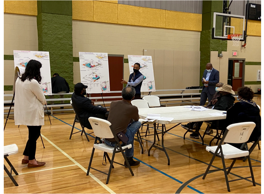
November 2021 public engagement session