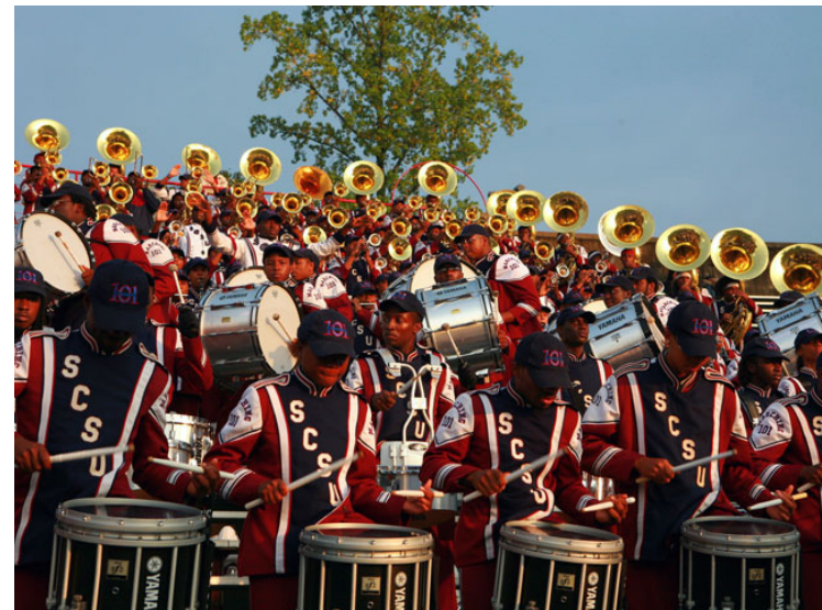
South Carolina State University Marching Band