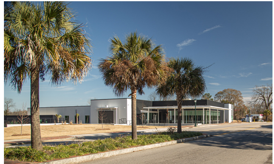
New Orangeburg County Library