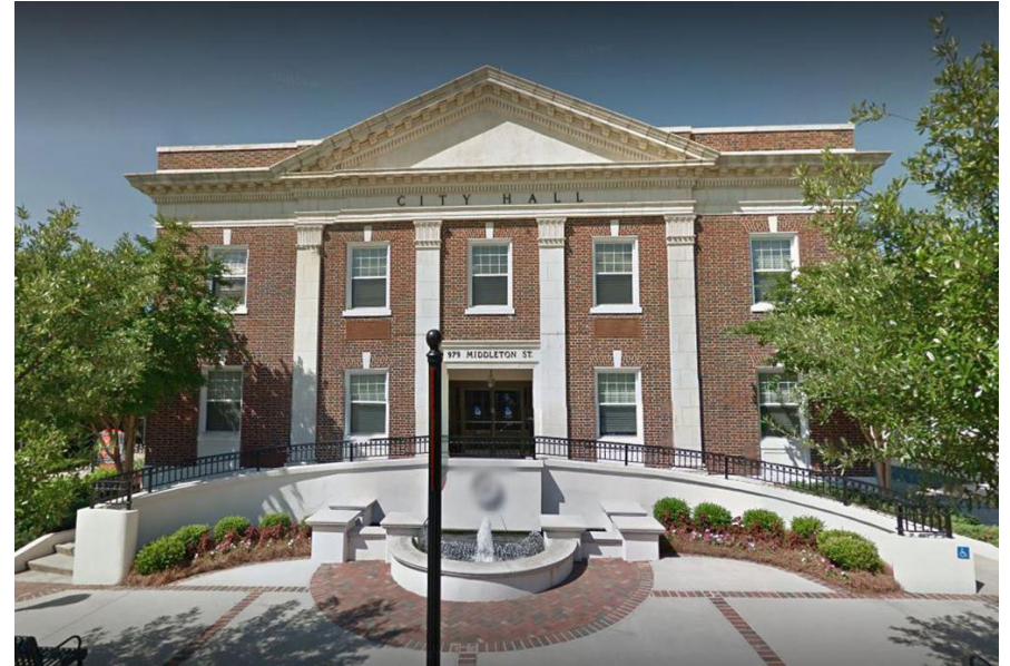
Orangeburg City Hall

The City is prepared to seek state and federal funding for the completion of the overpass. The selected development team would be expected to work in partnership with the City, county, universities, SCDOT and Norfolk Southern, which owns and operates the railroad tracks over which the overpass will span, on the planning and implementation of the overpass.